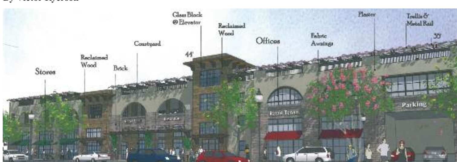
View from Orinda Way